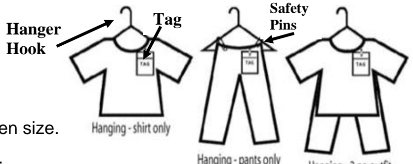
Hanging - pants only Hanging - 2 pc. outfit